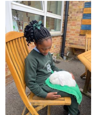
Our rabbit Micah has been a huge success. He has a very busy lunch time which I think he actually looks forward to – he gets to have a run around, check out my office and get fussed over by the children. We love him!