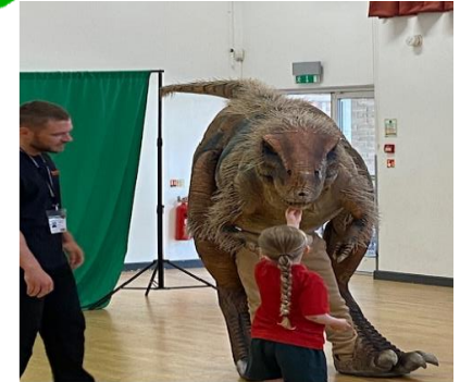
What a great experience for Nursery and Reception from TeachRex – the children got to interact with baby dinosaurs, creating a fun and safe environment for learning.