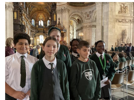
St Paul's Annual Schools Service